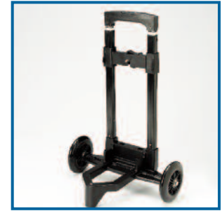
Detachable Wheeled Cart (306DS-626)