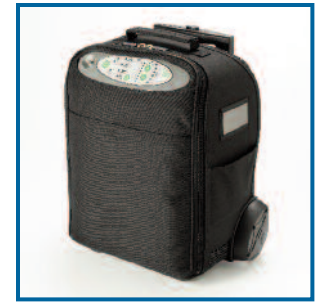
Deluxe Rolling Carry Case (306DS-635)