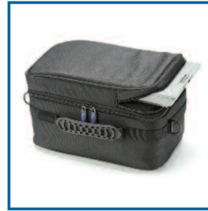
Accessory Bag (306DS-655)