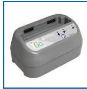
Battery Charger (306CH)